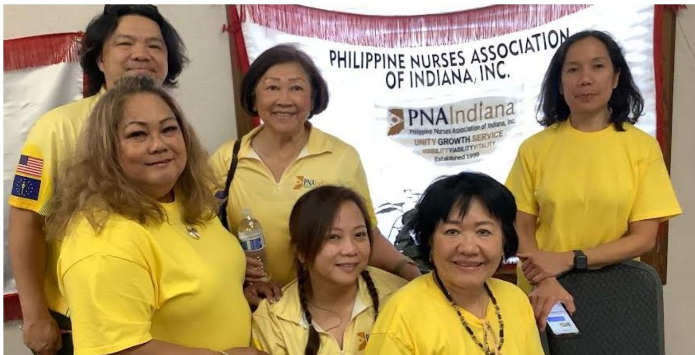
PNA-IN at Camp Aruga, Lake Potawatomi, Angola, Indiana