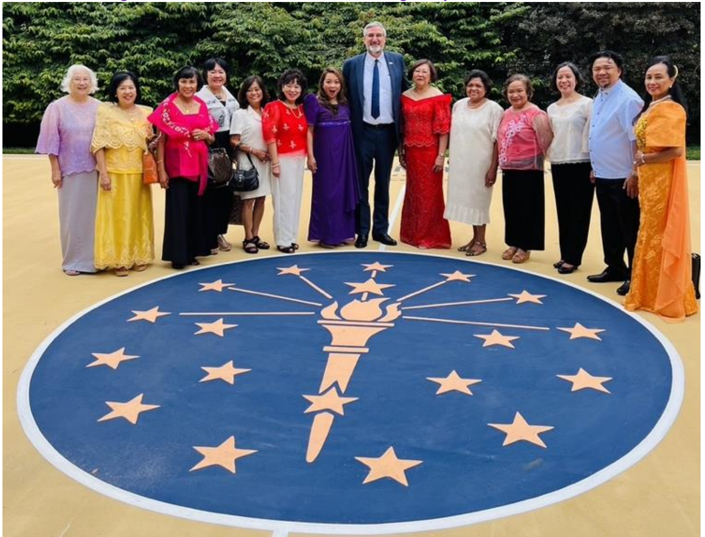
PNA-IN Awards Indiana Governor Eric Holcomb for Healthy Indiana and for signing HB 1003 into law