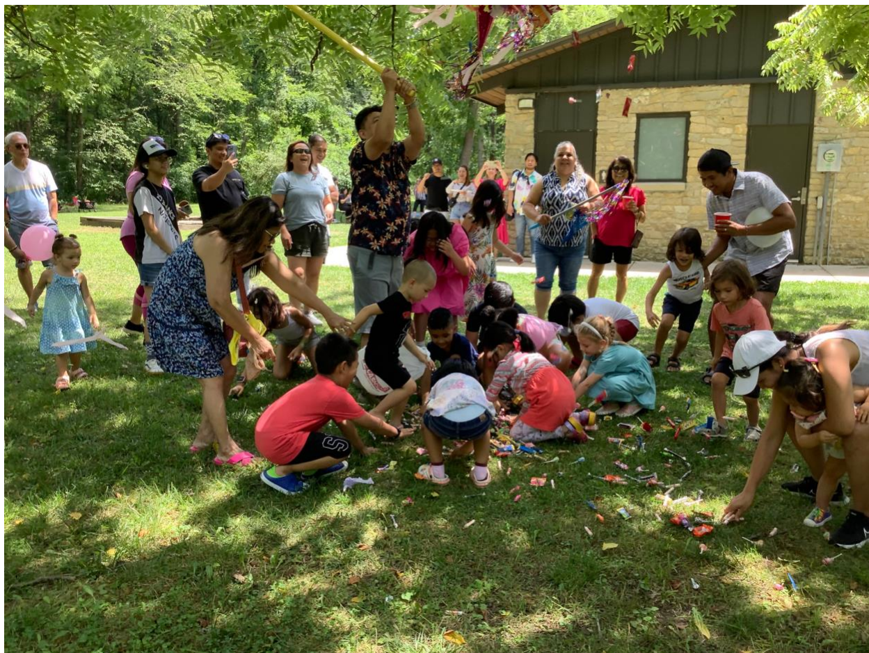
There's a joyful anticipation for next year's summer gathering and years to come. Hats off to PNA-IN for commemorating the first ever appreciation summer picnic!